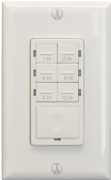
Part #42803 White