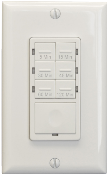
Part #42801 White